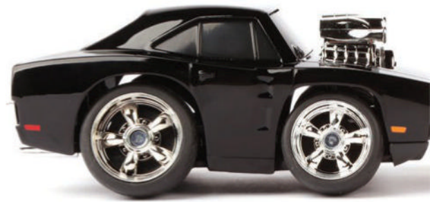
The larger 1:28-scale Small Blocks are satisfying to play with and look great on display.

J ada continues to find new ways to keep things fresh, and the Small Blocks series is a good example of that. Instead of chasing strict realism, this line leans into a stylized, cartoony look that still keeps each car recognizable. The result is something that feels just as much like a collectible as it does a toy you'll want to pick up and mess with.