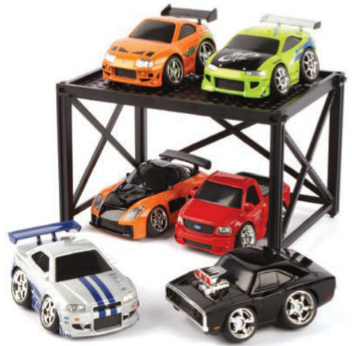
The 1:43-scale Small Block collection includes many favorite vehicles from the Fast & Furious movie franchise.

If this first release is any indication, there's plenty of room for Jada to expand the lineup. And with a franchise as deep as Fast & Furious, there's no shortage of cars that would fit right into this format.