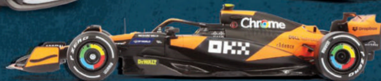
BBURAGO McLaren MCL38