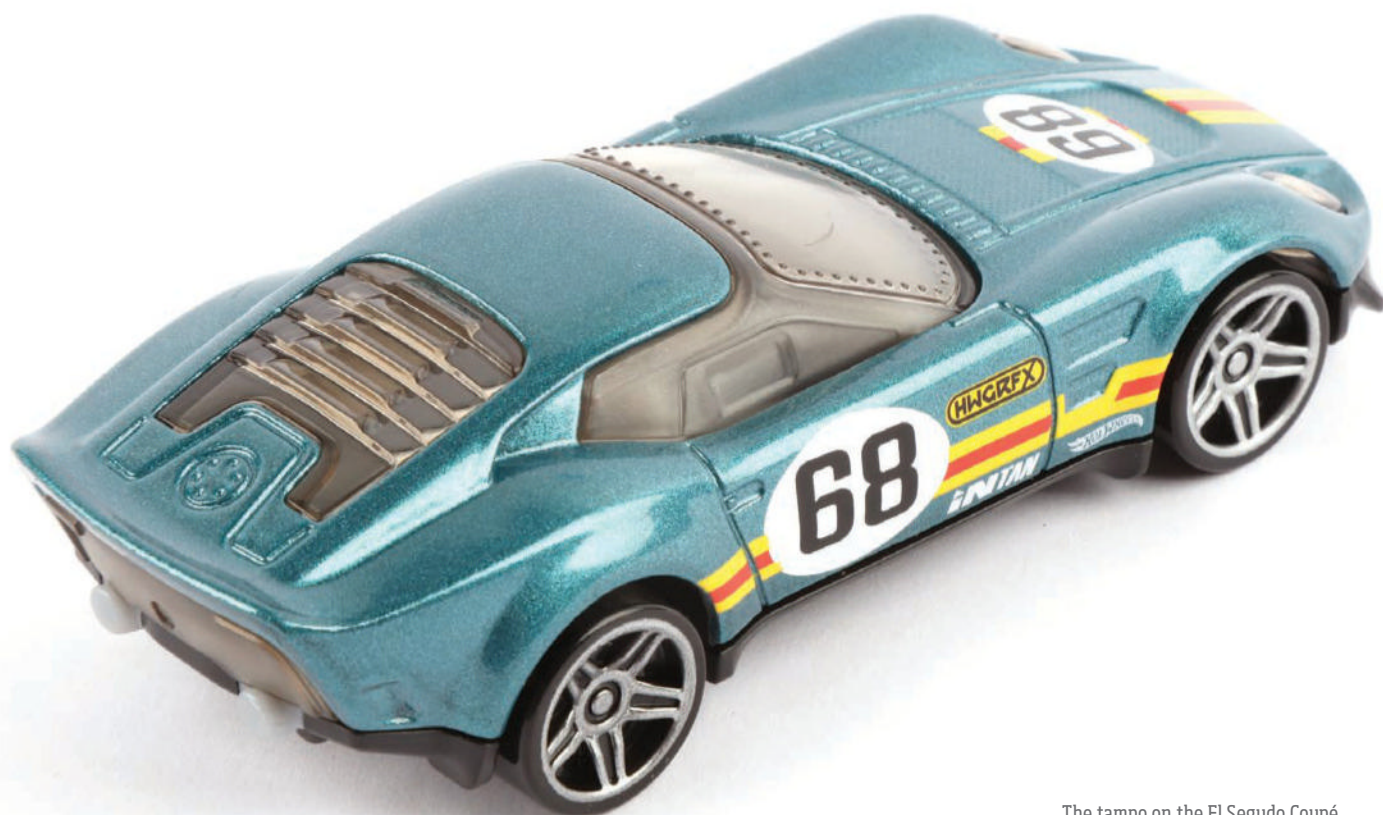
The tampo on the El Segundo Coupé lends the car the look of a European rally racer from the 1960s.