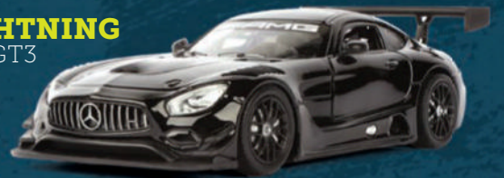
JOHNNY LIGHTNING Mercedes-AMG GT3