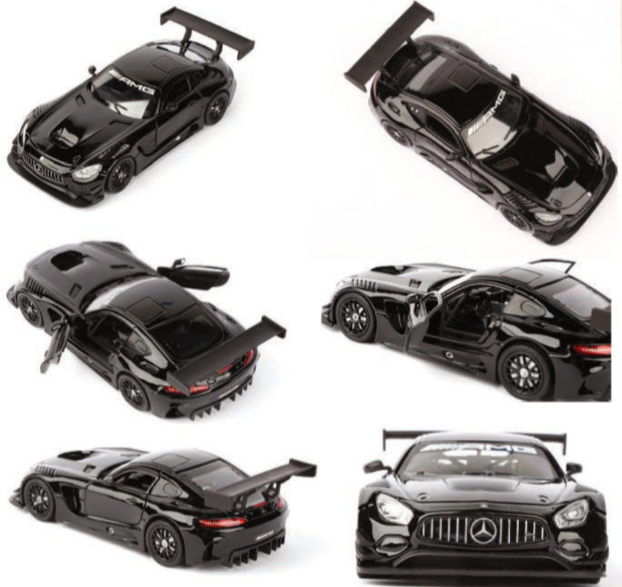
The model's 1:24 scale makes it large enough to appreciate the nicely finished details like sculpted vents, racing wheels, and low-profile tires.

For those building out a mixed display of racecars or modern performance machines, this AMG GT3 fits right in. It's simple, good-looking, and captures the essence of the real car without overcomplicating things.