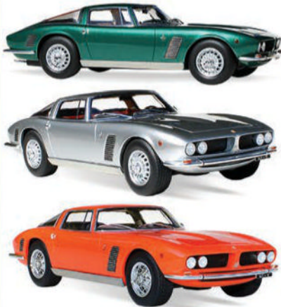
1969 ISO GRIFO