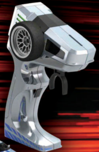
1999 Nissan Skyline GT-R BNR34*

*Pre-Production Sample - Not Final Subject to Licensor's Final Approval