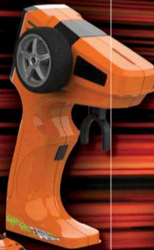
1994 Toyota Supra MK IV*