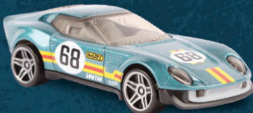
HOT WHEELS XL El Segundo Coupé