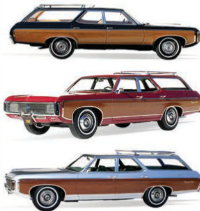
1969 CHEVROLET KINGSWOOD ESTATE