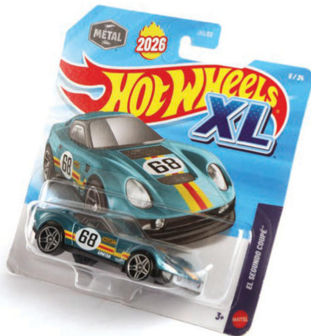
Not only is the Hot Wheels XL car bigger, but the packaging is as well.

What works especially well here is the design itself. The El Segundo Coupé has the proportions of a small European-inspired sports coupe, with